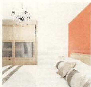
■ Wardrobe Made to order and designed by P-Lan Design t: 087 6350634