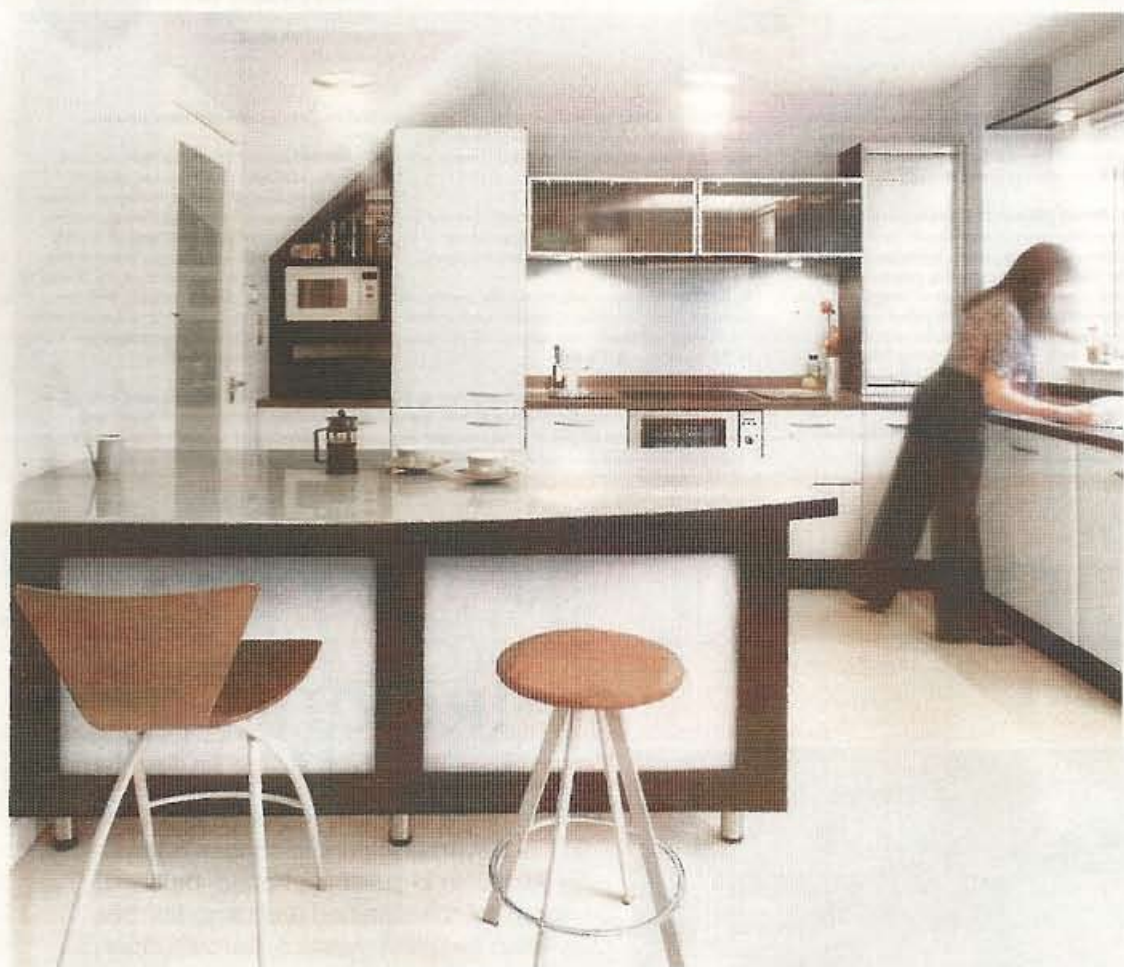
■ Kitchen Designed by P-Lan Design. Manufactured by Newcastle Design